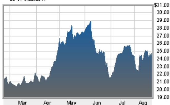
■ BROOKS AUTOMATION INC as of 8/22/2017