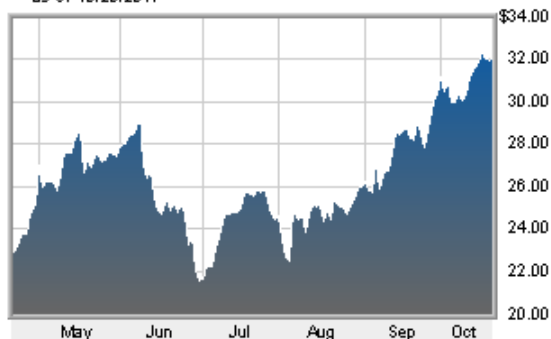
■ BROOKS AUTOMATION INC as of 10/20/2017